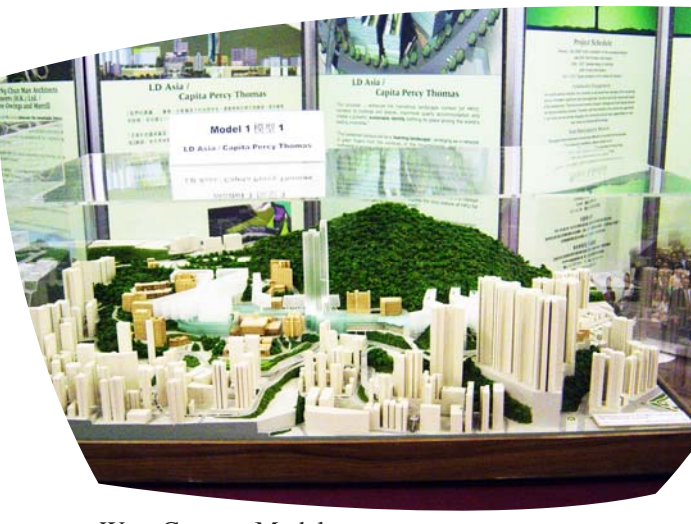
West Campus Models