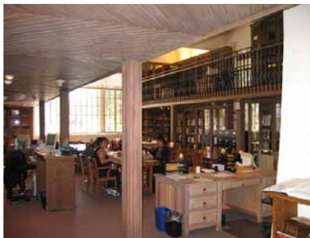
University of New Mexico Library and its Special Collections.