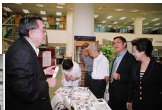
Several Medical Faculty Alumni (1964 and 1966), together with their families visited the Medical Library.