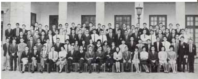
Exhibit of a photograph from Elixir, a Student Medical Society publication