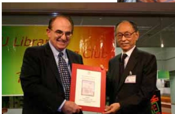
The Hon Sir TL Yang (楊鐵樑爵士) talked about Living Islam : from Samarkand to Stornoway on 25 November 2004.

(Librarian presenting a souvenir to Sir Yang after the talk.)