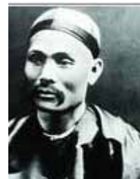
Tang Tingshu 唐廷樞

This 19 th -century publication comprising of 6 volumes is written by Tang Tingshu in the Cantonese dialect. It was tailored to the Canton people who had business transactions or were connected with westerners or foreigners.