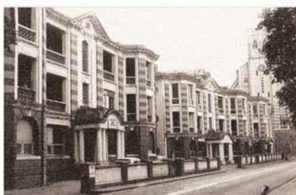
Law Library, early 1970s