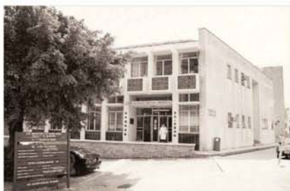
Lee Hysan Medical Library at Patrick Manson Building, ca. 1998

On electronic resources, the Library was quick to learn the new technology and position itself as early adopters of computing resources. In 1980, for the first time, Online Information Service was offered using the ORBIT system of SDC Search Service, Santa Monica, California, with a satellite link arranged by Cable & Wireless (now PCCW). Later in 1988, CD-ROM based information services were introduced. The new compact, cheap and robust mass data storage medium made available convenient and economical access to the fast growing electronic information sources.