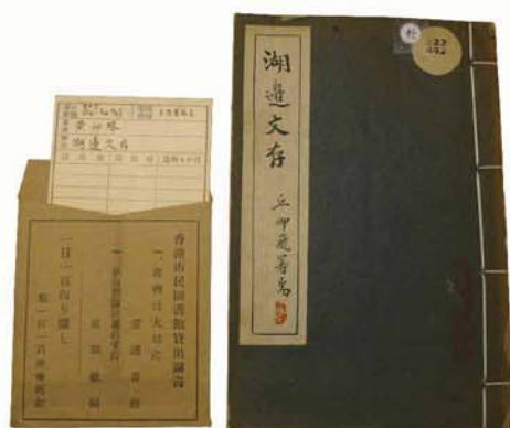
A book returned from Japan

The 1950s was a decade of unprecedented development for the Library. Its bookstock grew from 110,000 volumes to 233,000 volumes, whilst the number of professional Librarian posts increased from one in 1950 to eleven by 1960.