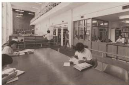
Hung On-To Memorial Library (Hong Kong Collection) with mezzanine floor, ca. 1970.